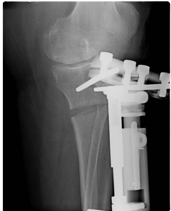
Figure 2 Radiograph of high tibial osteotomy using the hemicallotasis technique.

The association between preoperative knee alignment (HKA angle) and preoperative knee pain (KOOS subscale pain), and change in knee alignment with surgery (the difference between preoperative HKA angle and postoperative HKA angle) and change in knee pain over time was assessed by simple regression analyses. Multiple regres-